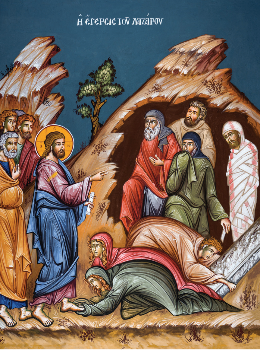
Ἡ ἙΓΓΕΡΣΙΣ ΤΟΥ ΛΑΖΑΡΟΥ